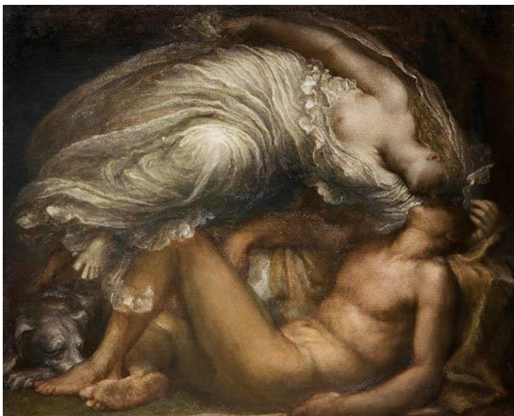
Endimion and Selene de Watts (dog with eyes open)

The Moon is the mother of fate and is known by a multiplicity of names, but it is rare to find a goddess in some Greek, Celtic or Mesoamerican pantheon that does not possess a lunar appearance or manifestation, but it is difficult to find a Lunar Goddess who possesses all the symbolic characteristics. The Moon is the mother of fate and Maya means illusion and comes from the verbal root "ma", measure, conform, form, build, create, show or expose.