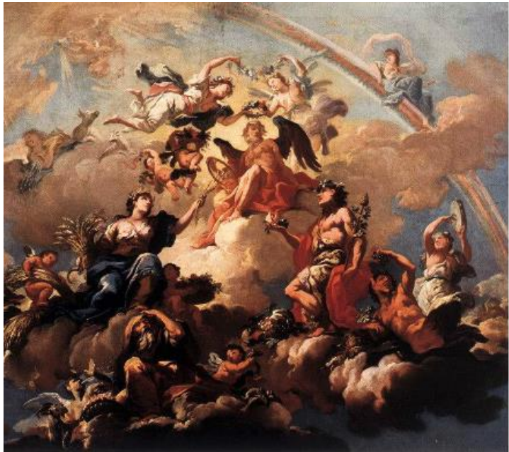
As quatro estaes homenageando Cronos Bartolomeo Altomonte 1737

In ancient times nature shows had a direct influence on the human psyche. Myths originate from an experience in relation to nature that fills the human being with wonder, fascination, helplessness, a religious feeling that we find difficult to understand today, since we have disassociated ourselves from it.