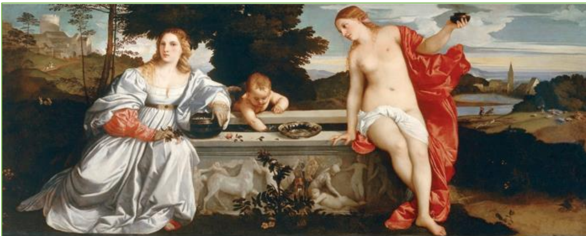
Sacred and Profane Love, Titian, 1515, Borghese Gallery

Aphrodite Urania " (Heavenly of Libra), since she comes from the castration of Uranus, daughter of heaven. who presides over the highest form of love – the highest love and love for the most elevated: "the heavenly" She is the one who puts order in Cosmos.